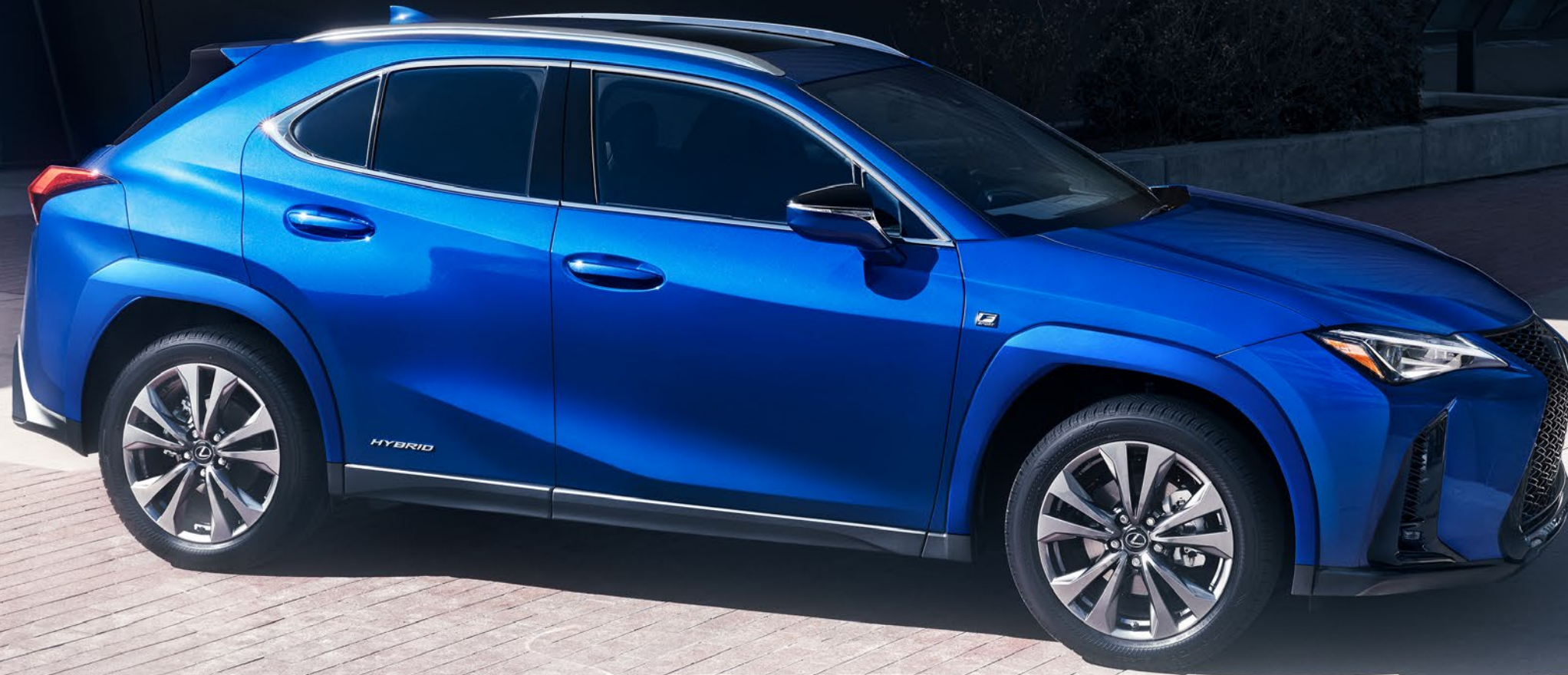
UX F SPORT shown in Ultrasonic Blue Mica 2.0 1