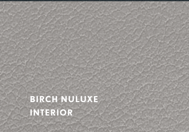
BIRCH NULUXE INTERIOR