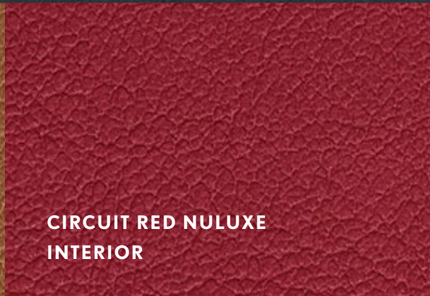
CIRCUIT RED NULUXE INTERIOR