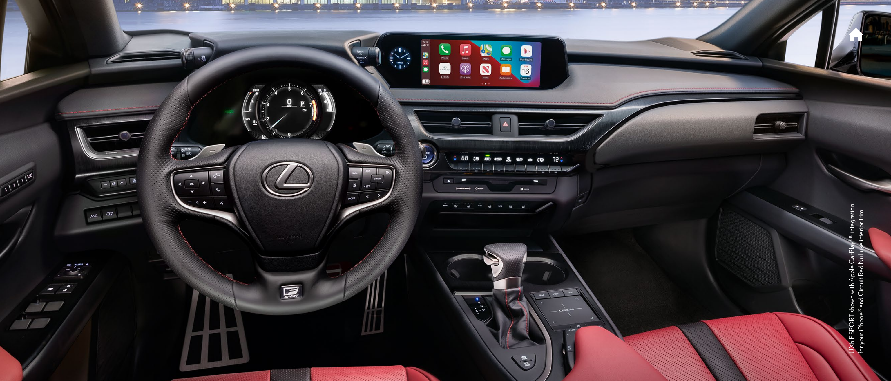
UXh F SPORT shown with Apple CarPlay SM integration for your iPhone ® and Circuit Red NuLuxe interior trim

DO MORE WITH YOUR SMARTPHONE. WHILE DOING MORE, PERIOD.