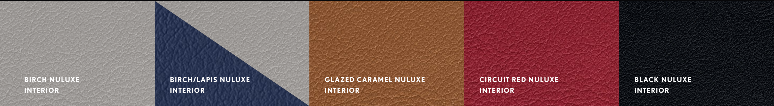
BIRCH NULUXE INTERIOR