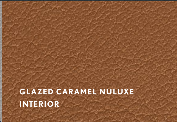
GLAZED CARAMEL NULUXE INTERIOR