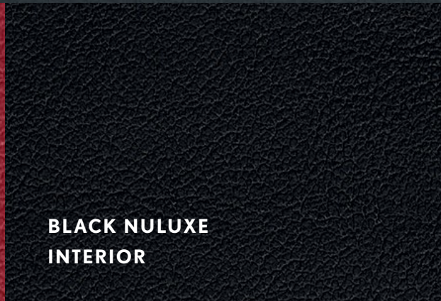
BLACK NULUXE INTERIOR