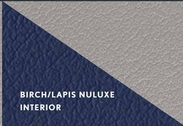
BIRCH/LAPIS NULUXE INTERIOR